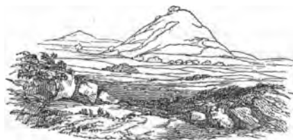
Mound of Marathon.

This over, I hurried to the battle-field. Toward the centre is a large mound of earth, erected over the Athe